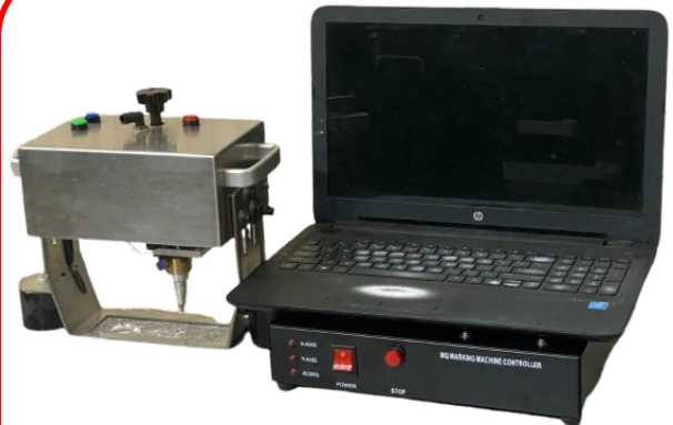
ALS - 2D Dot Pin Marking Machine