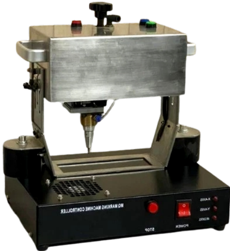
ALS - Portable Dot Pin Marking Machine