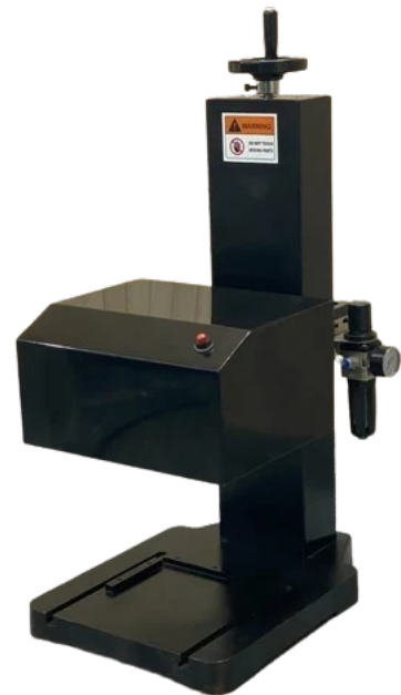
ALS - 3D Dot Pin Marking Machine

#2694, Timber Market, Ambala Cantt. Haryana (India)